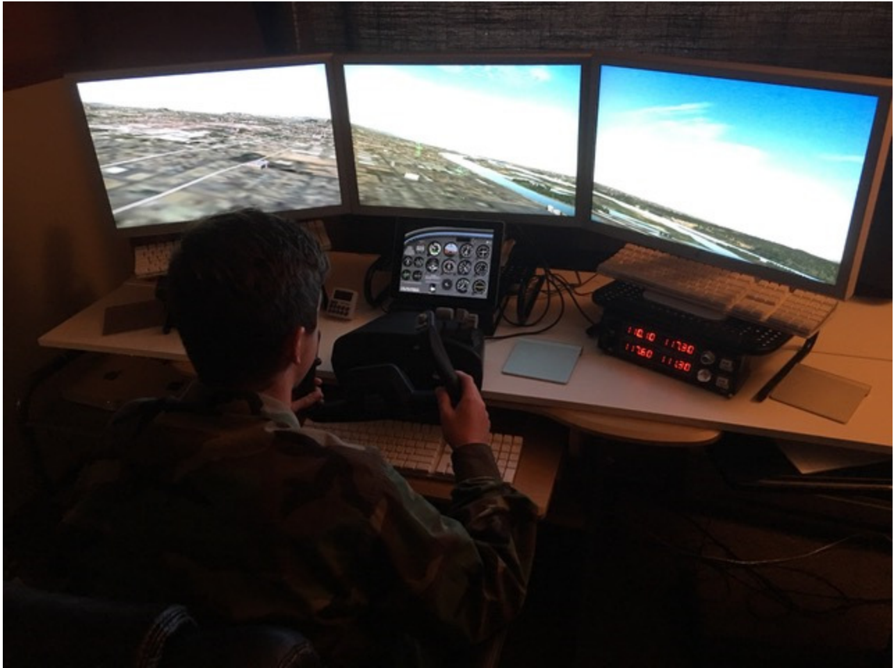
Cadet Miller flies a F-4 fighter on approach to Portland International Airport using Willamette Aviation's flight simulator.