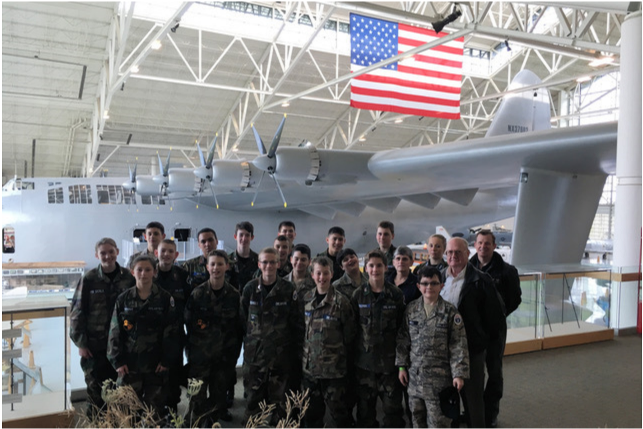
Participants in the Night at the Museum pose with the Spruce Goose in the background

Additional photos taken by SM Humble are available in the Photo section of the Squadron website .