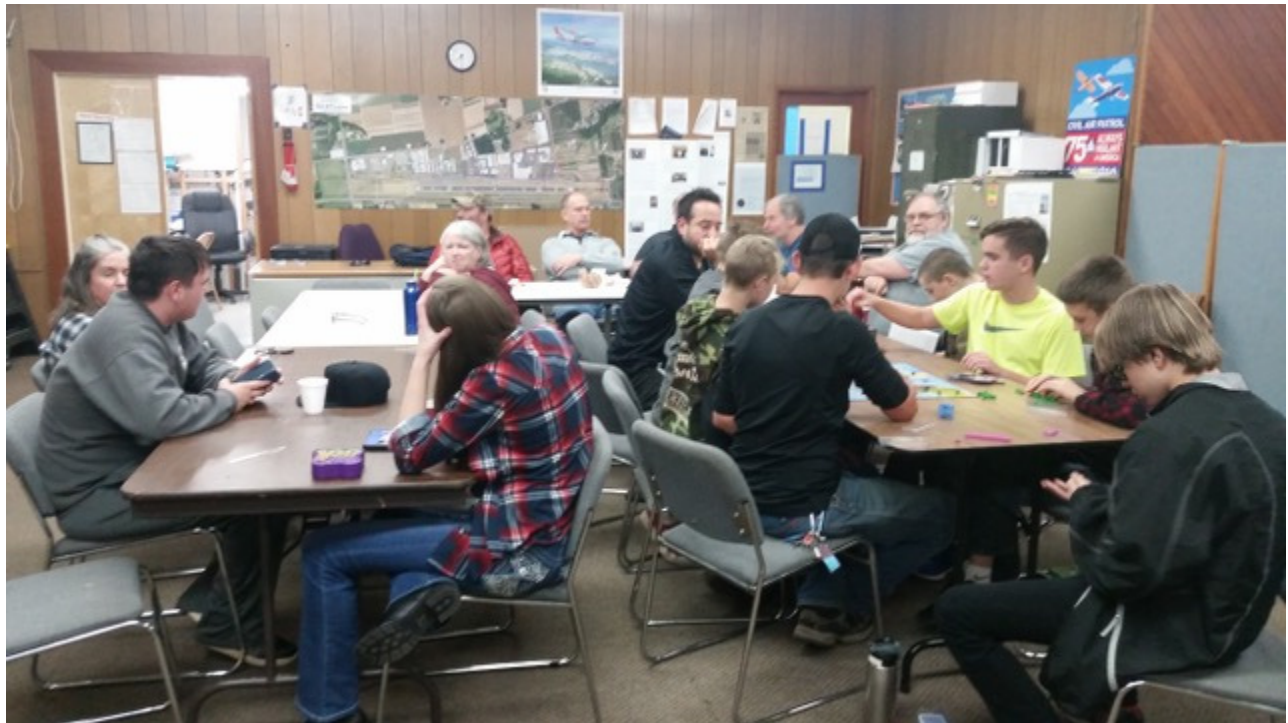
Members enjoy conversation and games

Last week's meeting was the fifth Tuesday of the month, and we enjoyed potluck, discussion, and games.